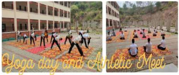
Yoga day and Athletic Meet