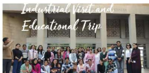
Industrial Visit and Educational Trip