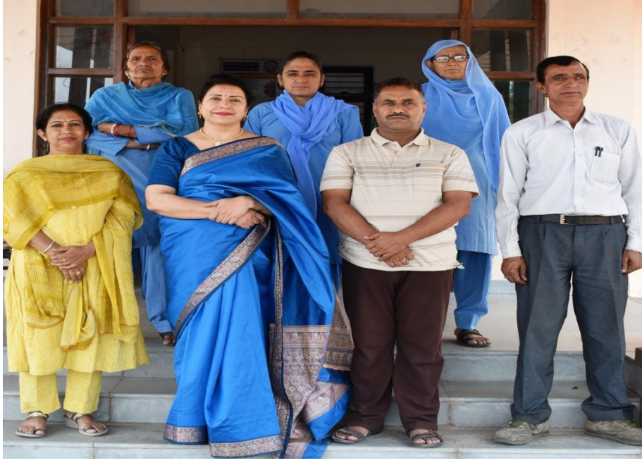
Non-Teaching Staff Photo With Principal

Use of Mobile Phones is not allowed in the College Campus