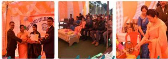
Annual prize distribution function